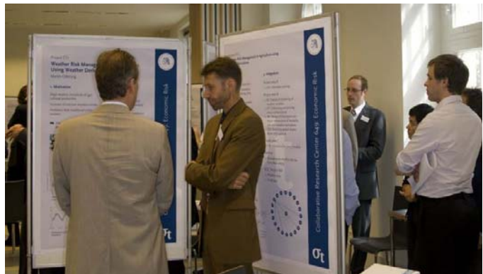
CRC 649 Poster session

The Q&A session on the Risk Data Center (currently called FEDC) was especially lively. The lunch break was preceded by a poster session during which all projects presented their posters in order for the evaluators to pose further questions.